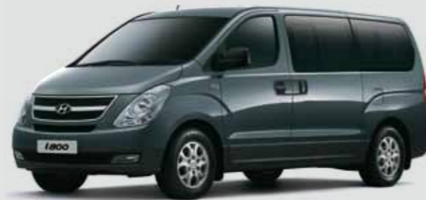
Grey Titanium (Mica)