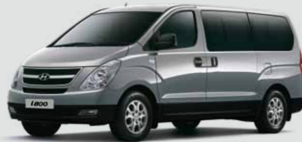
Hyper Silver (Metallic)