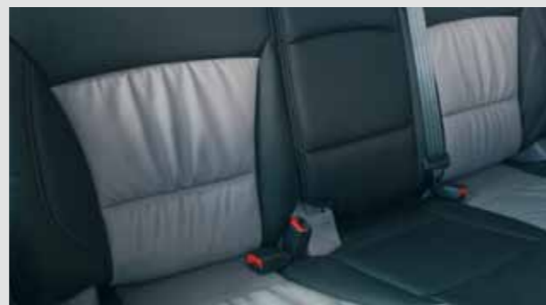
Leather Seat Trim (seat facings only) ▲▲

▲ Special order only. Please be aware that Hyundai Motor UK Ltd does not hold stock of these derivatives therefore factory lead times apply.