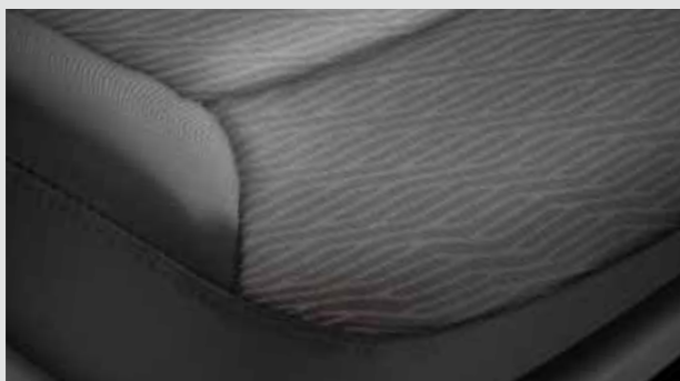
Cloth Seat Trim