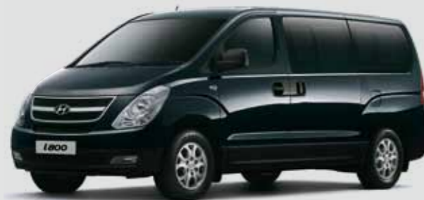
Space Black (Mica)