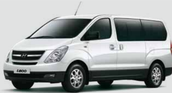
Ceramic White (Solid)