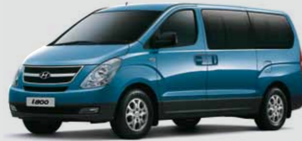
Blue Diamond (Metallic)